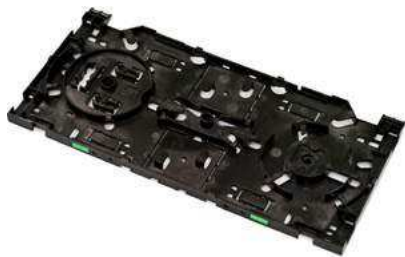
Cassette with an option to mount splitters