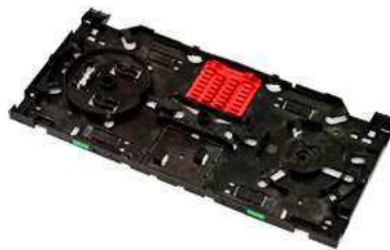
Cassette with an option for 12 fusion splices